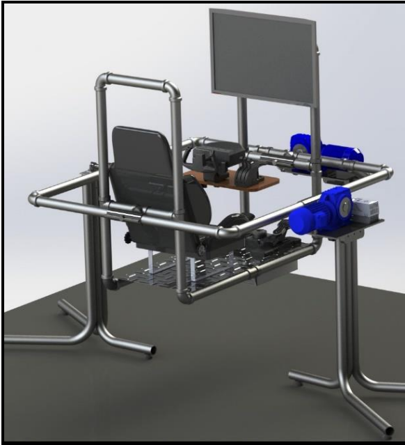
Fig.2: Other view of the Flight Simulator

Fig.2: Other view of the Flight Simulator shows another view of the simulation platform, which can be seen interface devices with a replica of the joystick used in the Cessna 172 as well as accelerators, in addition to a 32 "TV for visual simulation.