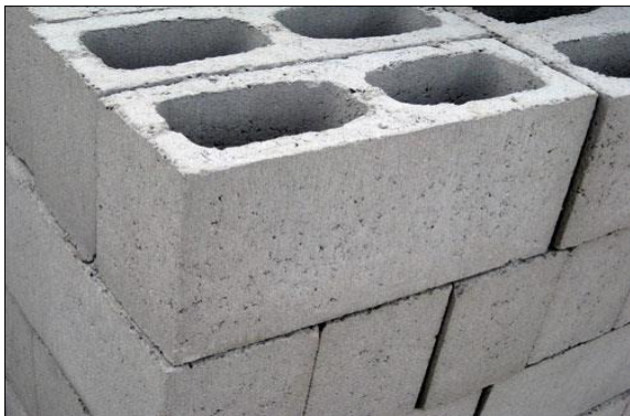
Fig. 4-Concrete Block