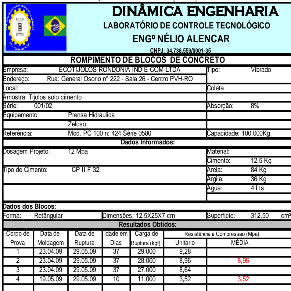
Table.3 – Results of Resistance and Absorption of Soil-Cement Bricks

In the tests of compression and water absorption, performed in Porto Velho (RO), in the Laboratory of Technological Control of Dynamics Engineering, under the responsibility of Engineer Nélio Alencar, the following results were obtained: