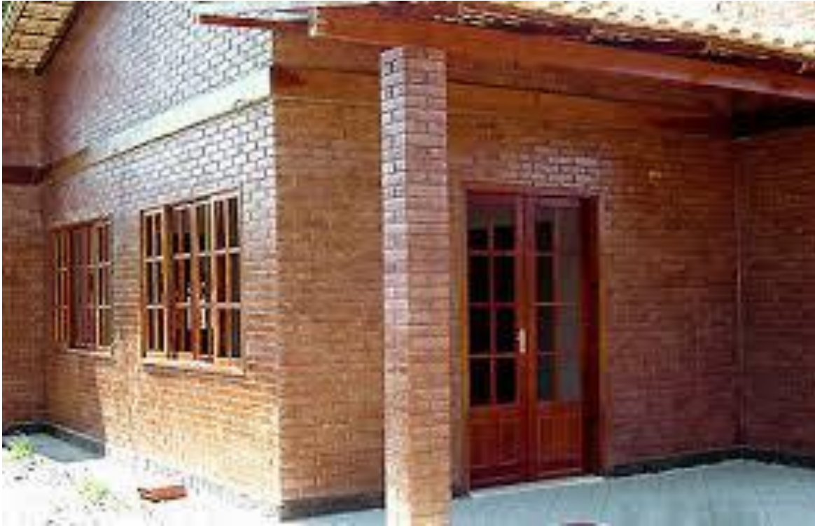
Fig. 7 – Soil Brick Housing Complete