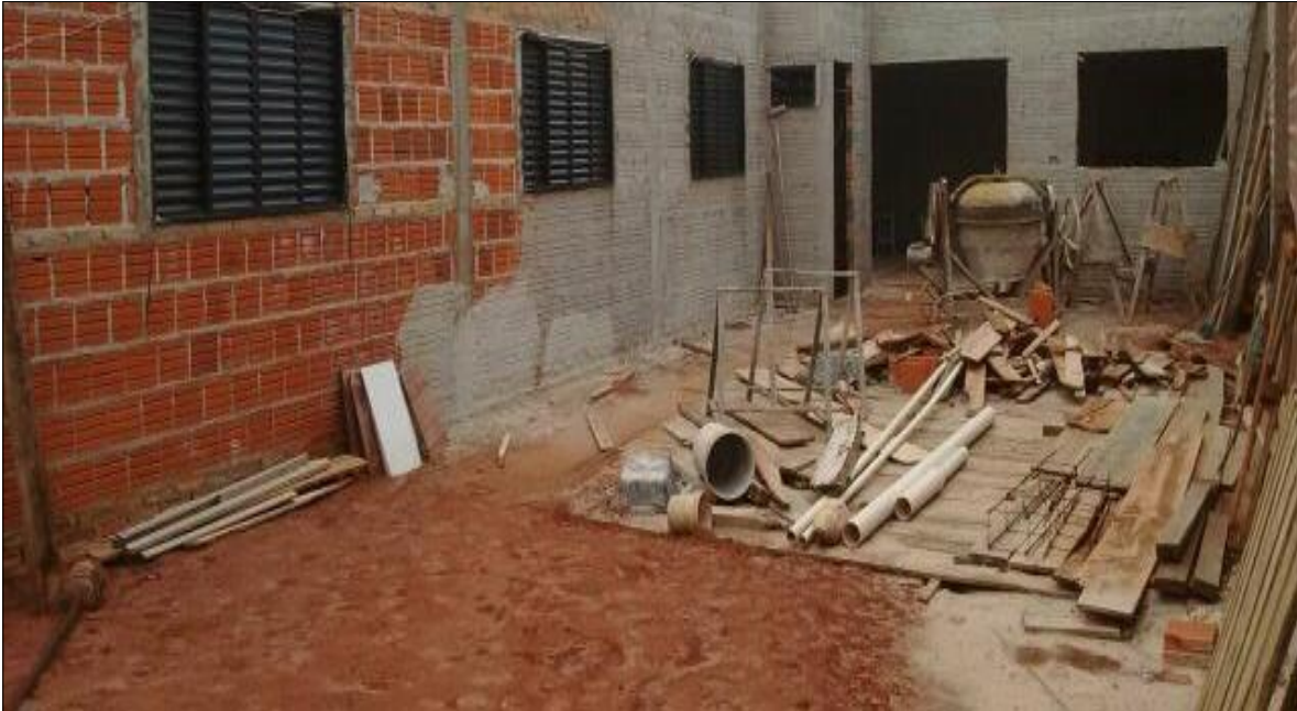
Fig.1 – Conventional Construction

construction of a dwelling, basically it does not generate rubble, it requires very little labor and the costs and time of execution are much smaller.