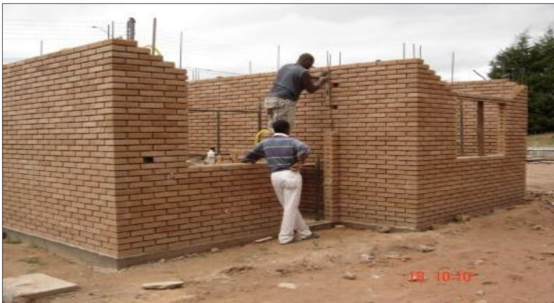
Fig. 2 – Construction with Structural Masonry