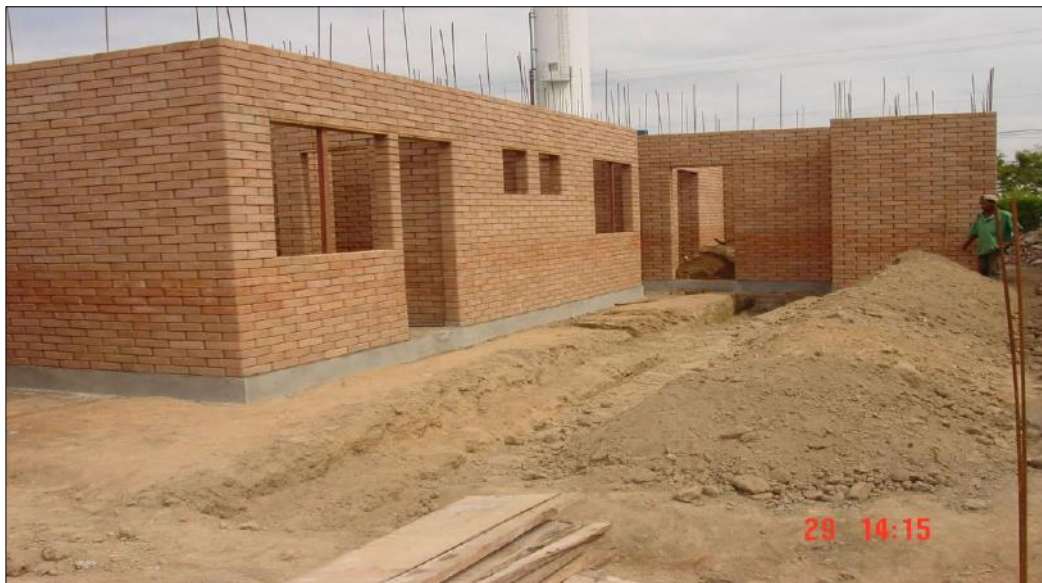
Fig. 6 – Structural Masonry with Soil-Cement Brick in execution

Structural Masonry added to the use of the Cement Brick (Figures 6 and 7) is currently the most appropriate response to assist in combating Housing Deficit and Environmental Pollution generated by the Construction Industry and the ease of extraction of raw material, to serve it, in the State of Rondônia.