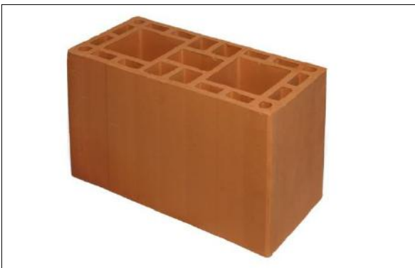
Fig.3– Structural Ceramic Block

The most used materials in Structural Masonry are the pre-cast blocks of structural ceramics, concrete (figures 3 and 4) and brick/block of soil-cement (figures 5).