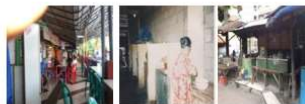
A B C