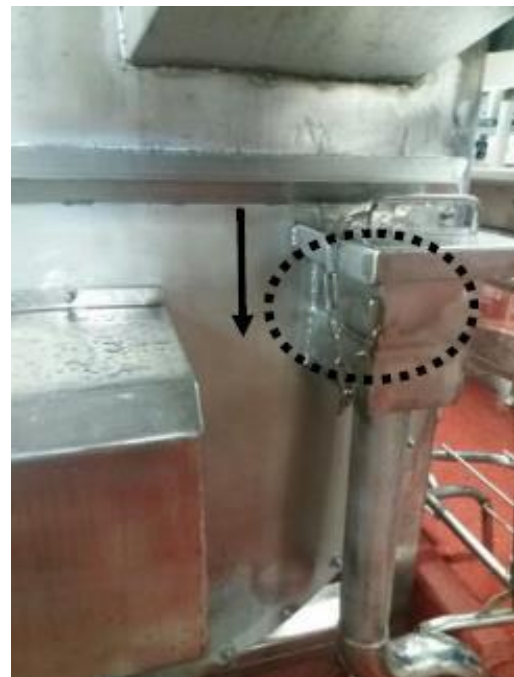
Fig. 7: Improvement in the water renewal piping of the chiller

Figure 7 shows the improvement that was performed in the outlet piping to renew the water of the leg quarter chiller. This water removal occurred through the exit of the technological chiller, i.e., together with the output of the product, causing a problem for the company since the correct thing would be for the water renewal to occur at the entrance of the chiller, along with the entry of the product (against the chiller flow). This way, the renewal of water was taking place incorrectly and the existing spillway did not reach the level of the water for renewal.