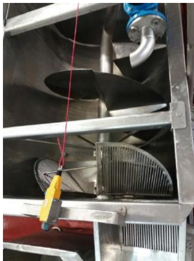
Fig. 6: Changes in the leg quarter remover from above

Figure 7 shows the improvement that was performed in the outlet piping to renew the water of the leg quarter chiller. This water removal occurred through the exit of the technological chiller, i.e., together with the output of the product, causing a problem for the company since the correct thing would be for the water renewal to occur at the entrance of the chiller, along with the entry of the product (against the chiller flow). This way, the renewal of water was taking place incorrectly and the existing spillway did not reach the level of the water for renewal.