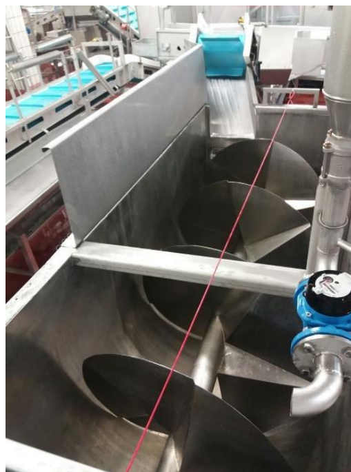
Fig. 2: Turkey leg quarter water chiller studied in this work

After the passage of the leg quarters through the chiller with water, they are sent through conveyor belts to the boning and manual fileting section to remove the bone, excessive fat, arteries, tendons and defects, such as hematomas, gore and others. In this step, the cuts are standardized according to the intended final product. Figure 2 shows the chiller used in the work.