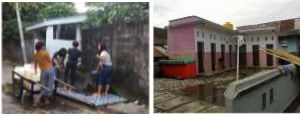
Fig.4: Public taps and public toilets (public toilets)

Left figure a group of teenagers was taking water at public taps, the distance between teens close to each other. The young women are in a small group of 4 people have an almost same age. The right figure, a condition of public toilets was deserted during the day.