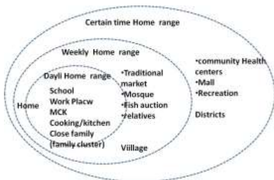
Fig.7: The movement of the population based on fishermen's routines

Separation by age group shows that adult women, the elderly, children and young women are still in the zone nearest the house in activities.