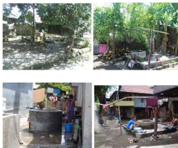
Fig.3: Public wells

At certain hours, public wells are visited by citizens, particularly women. The arrival of women in these places, especially in the morning and afternoon. In the early morning hours, that is between 800 to 1000 hours, when the children had gone to school. The frequency of use is highest in the morning than in the afternoon. Washing clothes is an activity that most frequently used compared to other activity. These activities are carried out jointly, while other needs such as urinating, defecating, and bathing are done individually and sometimes limited by room. At the time of washing that occurs active communication between them, they are often also disputing in the well general. Ablutions are done by men in public wells, before the midday prayer, Asr, and Maghrib. Ablution almost never does in public restrooms or public taps. The following picture shows the situation and conditions in clean water facilities Galesong fishing settlement.