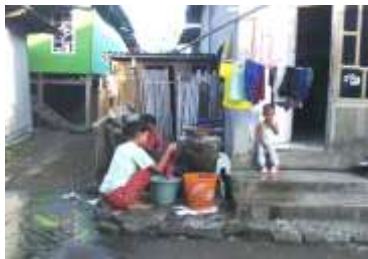
Fig.5: Mutual Assistance between daughter and mother in semi-private wells

Left figure a group of teenagers was taking water at public taps, the distance between teens close to each other. The young women are in a small group of 4 people have an almost same age. The right figure, a condition of public toilets was deserted during the day.