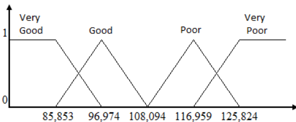
Fig 2. Membership Function of SEC Variable

Meanwhile, Figure 2 described the membership function for SEC variable.