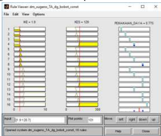
Fig 3. FIS Implementation using Matlab

Figure 3 described the real implementation in the matlab.