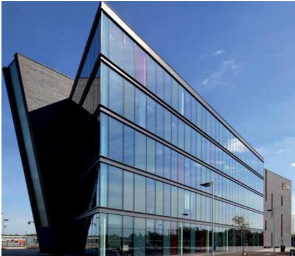
Fig.2: Multistorey Building