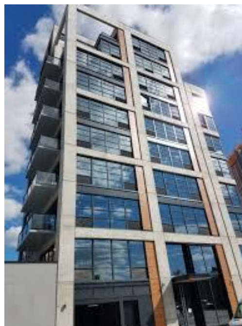
Fig.1: Multistory Building

In this era there are many multistory buildings that are constructed throughout the world. In the current circumstances of excess numbers of people and growing trend of lavish and attractive way of life in the quick rising nation, the structure sector faces new challenges gradually particularly the structural engineers to accomplish the dreams. To complete such type of require a variety of researchers have ended a lot of job and a lot fresh techniques are developed for every new generated trouble comprise of bracings, outriggers, RC shear wall and shear core, steel plate shear walls, box systems, base isolation, dampers, seismic invisibility cloak, rocking frame, etc. One of the answer adopted for our study for such type of troubles is outrigger system or we can say the appliance of this system i.e. use of shear wall belt at best height to make the construction competent of managing lateral loads developed due to seismic forces or may be due to wind effects in case of high rise building or twin tower or skyscrapers as per the need of hour. Here to face a lot of study work is done in the field of lateral load resisting system where a variety of such kinds of systems are analyzed next to a variety of constraints unconnectedly for specific circumstances and limitations. Shear wall and shear core both are optimized within the building against a variety of parameters but the use of shear wall as shear wall belt like outrigger beam system is not analyzed till now.