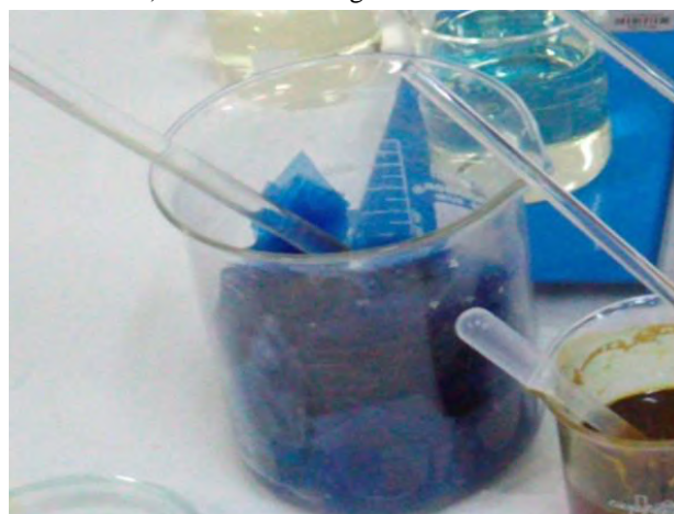
Fig.1: Cut sheets

portions and placed in different beakers (1000 mL). As shown in figure 01.