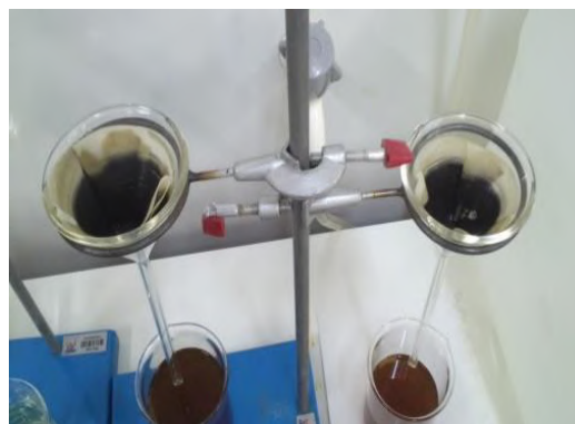
Fig.2: Filtration of AgCl and AgOH