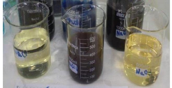
Fig.5: Solutions containing sample at rest