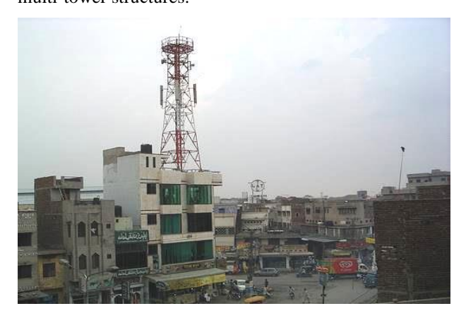
Fig. 2: Tower placed over multistoried building in city

limitation of building site properties. On the other site, they are the indications of economic properties and civilization. These days, multistory building density increase higher and higher, with added floors which are more complex and separate plan elevation criteria, such as multi-tower structures.