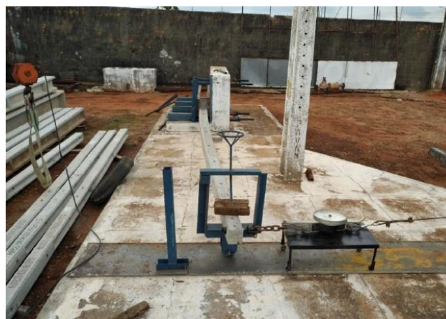
Fig.2: Bending test on molded posts.

The bending tests (Figure 2) were carried out at the company Concreto Artefatos de Cimento in Araguaína Tocantins , with 6 posts of 5m length, two specimens of each mix design, all with an approximate age of 28 days of cure.