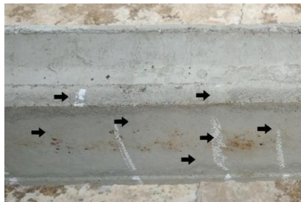
Fig.2: Identification of closed cracks after bending test.

becoming capillary pores, meeting the requirements of the standard, as shown in Figure 3.