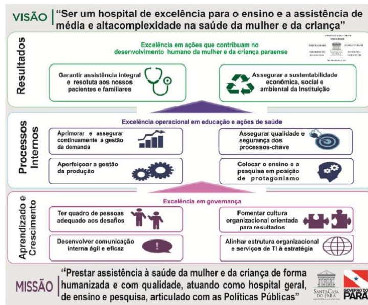
Fig.2: Strategic Planning Map