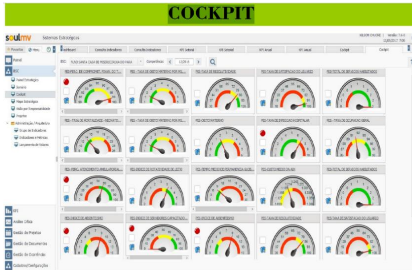
Fig.3: Strategic and Operational Indicators