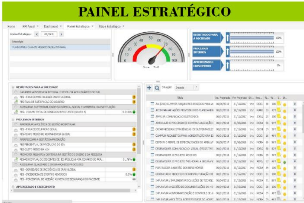
Fig.5: Project Monitoring.