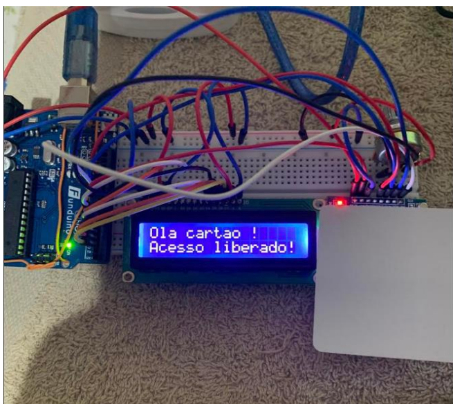
Fig. 7: Prototype accusing release.

After the installation and the prototype as shown in Fig. 8 and the implantation of the cards on the badges, we