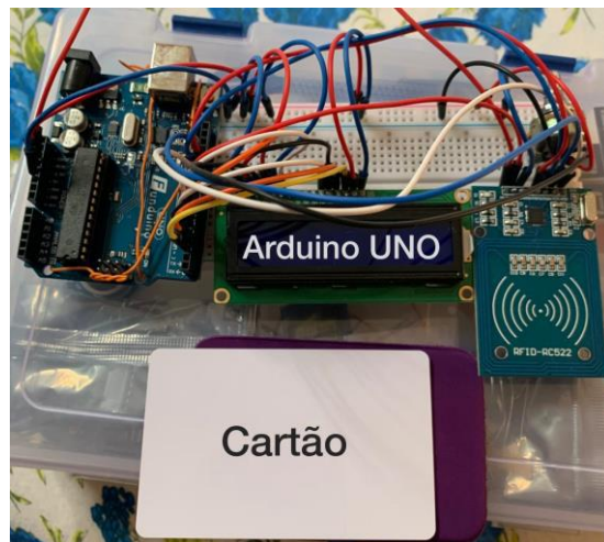
Fig. 8: Arduino e cartão.

monitored the entry and exit of the badges, thus verifying the veracity of the equipment functioning.