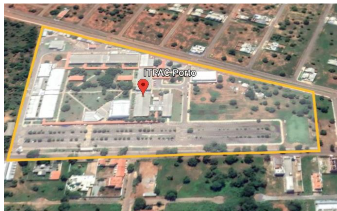
Fig. 2: Location of the Itpac- Porto Nacional FL

Five (5) RFID cards were inserted at random in the badges of building maintenance employees at the Presidente Antônio Carlos Institution - ITPAC / PORTO.