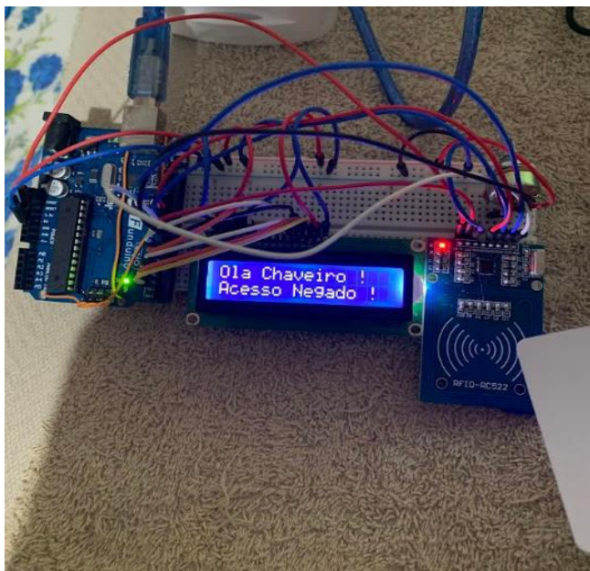
Fig. 6: Prototype accusing denial.

Therefore, with the programming done and the prototype working, we implanted it so that it could capture the electromagnetic waves of the employees' badges and identify their presence and their respective PPE's, the employee who is not registered or with problems at the point will be denied access according to Fig 6, the employee who is normalized and no pending will have access released as shown in Fig 7.