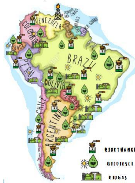
Fig 1: Biofuels in South America

The production of biofuels in South America is led by Brazil, Argentina, and Colombia, according to a study published by the Economic Commission for Latin America and the Caribbean (ECLAC) [5]. The Fig. 1 shows the biofuels available in each country from bioethanol, biodiesel, and biogas.