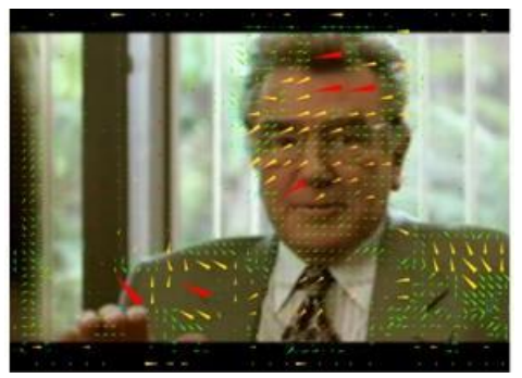
Fig.3: Variable BMA displacement vector

Variable-size block matching algorithms can be distinguished from each other by the technique of multiresolution and splitting criterion as shown in "Fig.3". Some of the most common methods of variable size block matching procedures include: quad tree approach, polygon approximation [8] and binary partition trees [9]. The quad tree multiresolution approach splits an image frame into four partitions each time based on splitting criteria. In contrast, the polygon approximation approach use content based information of approximate different regions on an image containing polygons.