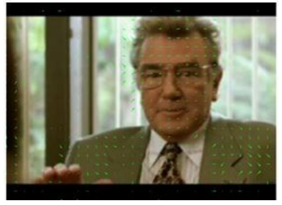
Fig.2: FSBMA displacement vector

In the fixed block matching algorithm, blocks are defined as non overlapping square parts in an image frame as shown in "Fig.2". Each block of the current frame is matched to a block in the next frame specified within a search window [6] [7].