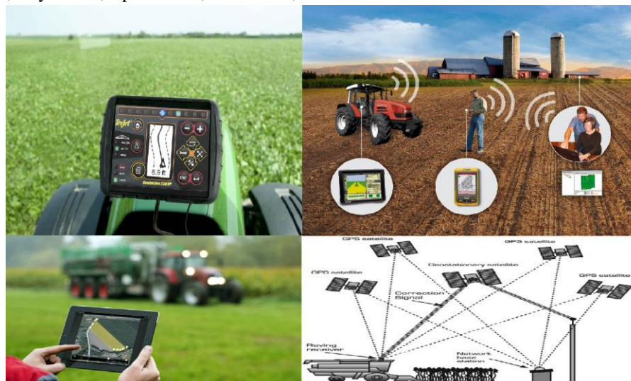
Fig.3: Application of GPS technology in agricultural production

Information Technology (IT) is an engineering branch that uses computers and computer software to convert, store, protect, process, transmit, and collect. information. In Vietnam, the concept of IT is understood and defined in the Government resolution 49/CP signed on August 4, 1993: "IT is a collection of scientific methods, modern technical facilities and tools - mainly computer engineering and telecommunications - to organize the effective exploitation and use of rich and potential information resources in all fields of human and social activities "[5] .